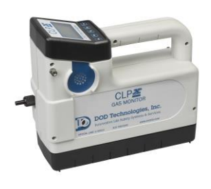
CLPX Portable Monitor