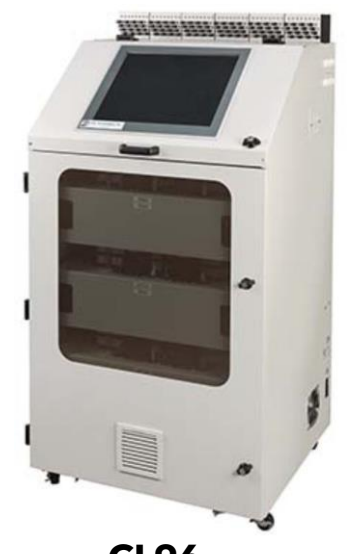
CL96 96-Point TGMS