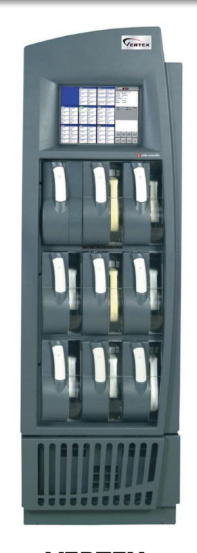
VERTEX 72-Point TGMS