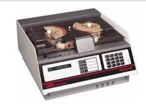
CM4 4-Point Monitor