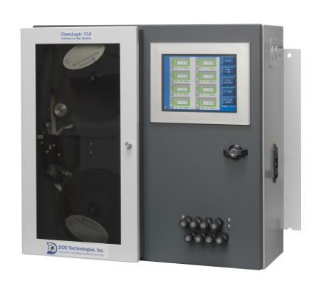
CL8 8-Point TGMS