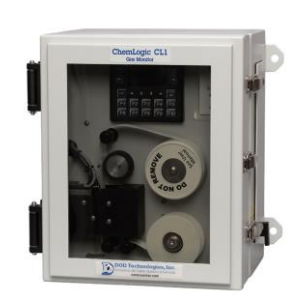
CL1 Single Point Monitor