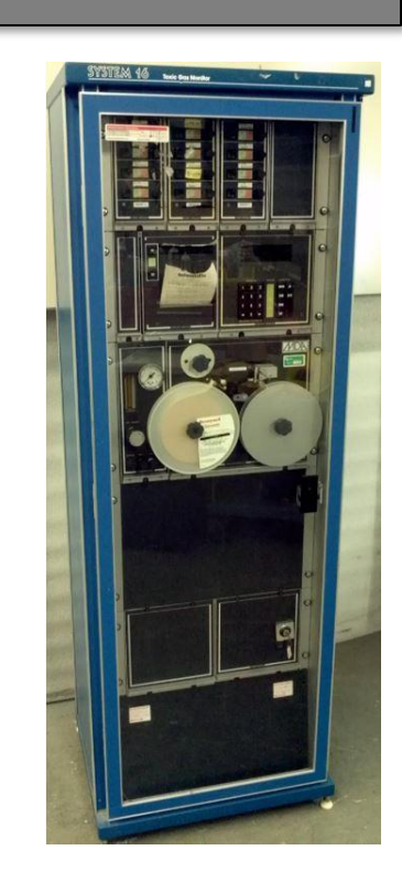
SYSTEM16 16-Point Monitor