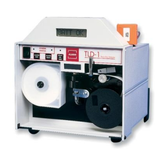
TLD Portable Monitor