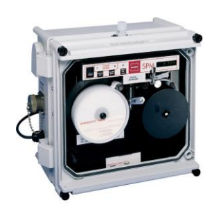
SPM Single Point Monitor